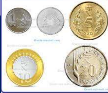
Different types of Indian Coins

L- Money L- Data Handling L- Fraction Table of 9 and 10 Table dodging