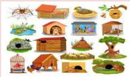
Making of House of different animals