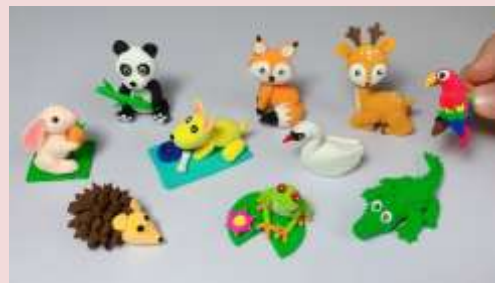
Clay modeling of animals