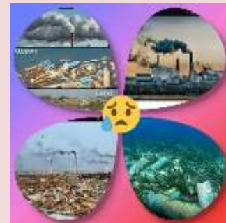
Collage on Different Pollution